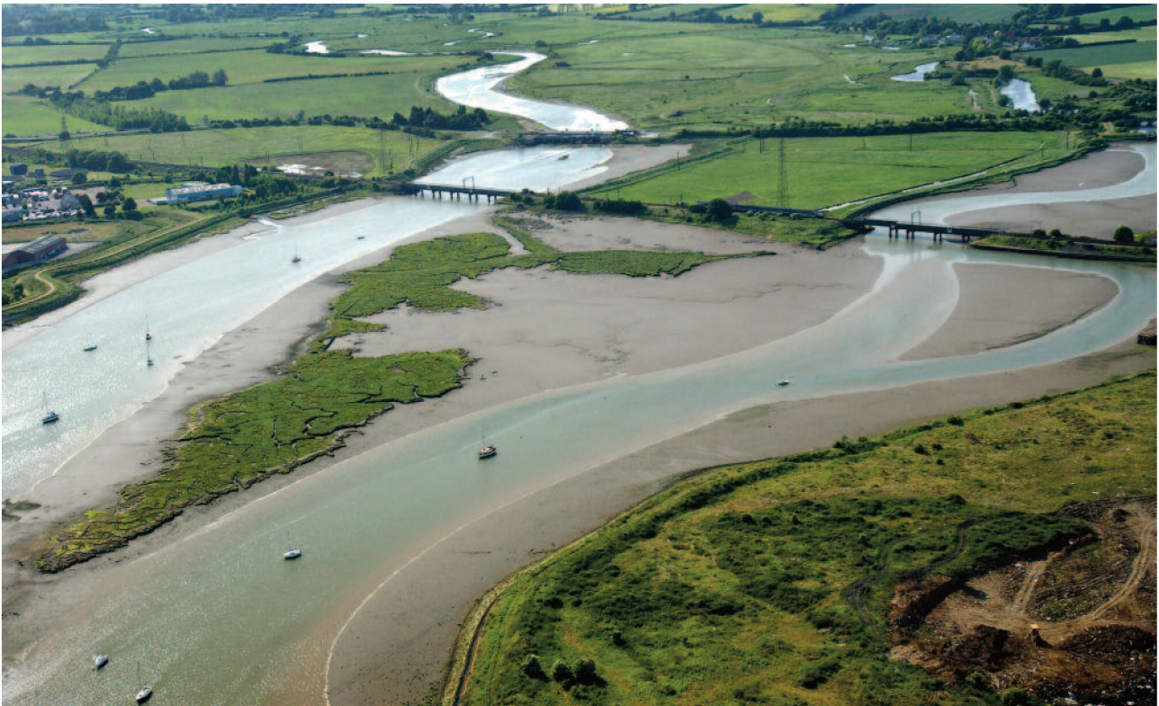
The River Stour at Cattawade: Part of the Dedham Vale AONB

If you need help to understand this information in another language please call 03456 066 067 .